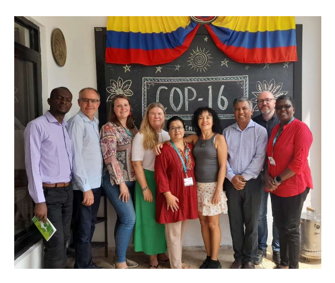
The SMC Delegation and the Tower