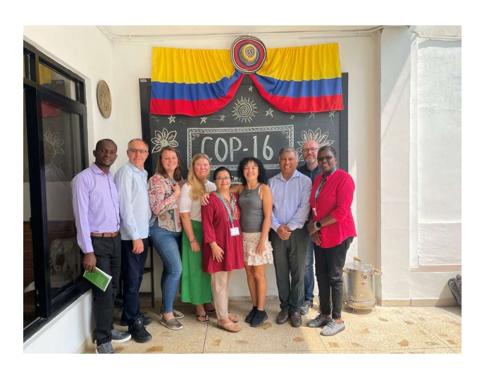
The SMC Network Delegation to CBD COP16