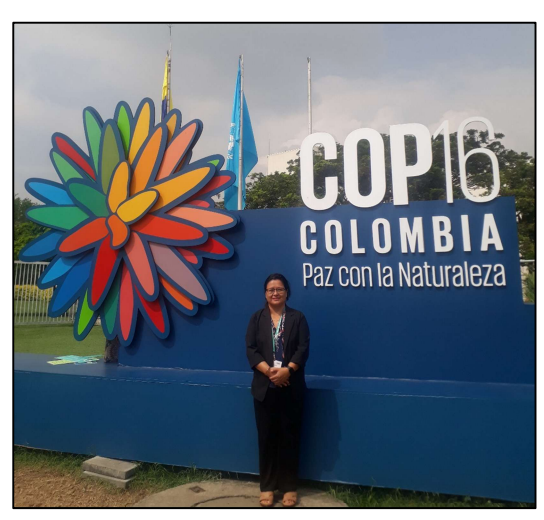
Starting Day 1: Peace for Nature Conference