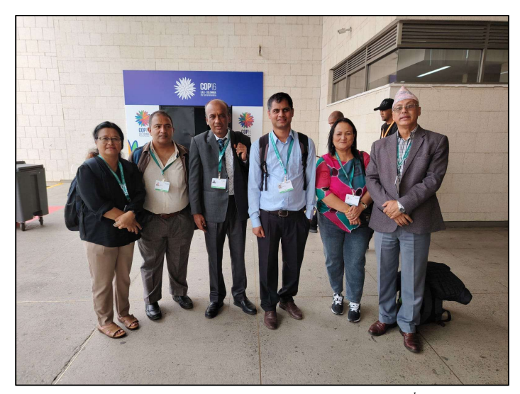
Ministry of Forest and Environment Joint Secretary (3<sup>rd</sup> from Left)