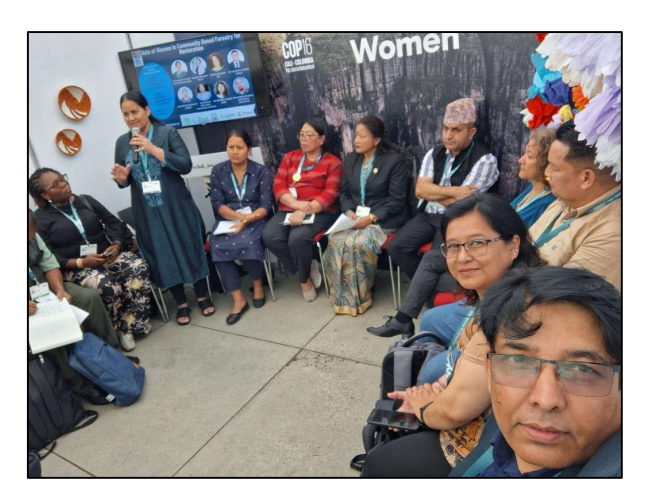
Women's Role in Community Forest Management at Women Pavillion in Quebec Center